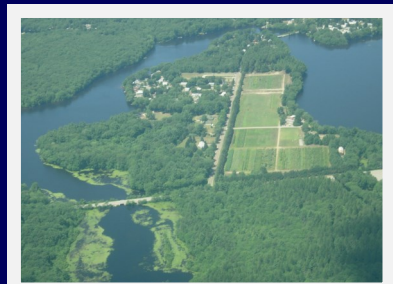
Griswold Research Center, Griswold

Griswold Research Center 190 Sheldon Road Griswold, CT 06351-3627