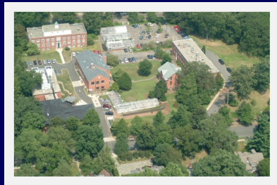
Main Laboratories, New Haven

Main Laboratories 123 Huntington Street New Haven, CT 06511-2016 Phone: 203-974-8500