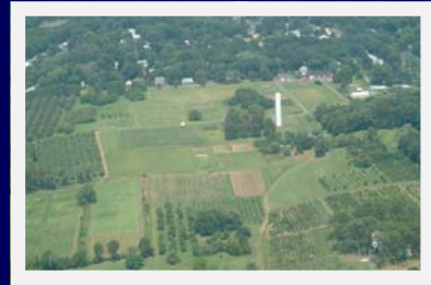
Lockwood Farm, Hamden

Lockwood Farm 890 Evergreen Avenue Hamden, CT 06518-2361 Phone: 203-974-8618