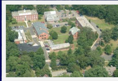
Main Laboratories, New Haven

Main Laboratories 123 Huntington Street New Haven, CT 06511-2016 Phone: 203-974-8500