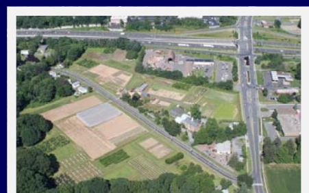
Valley Laboratory, Windsor

Valley Laboratory 153 Cook Hill Road Windsor, CT 06095-0248 Phone: 860-683-4977