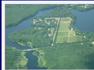
Griswold Research Center, Griswold

Griswold Research Center 190 Sheldon Road Griswold, CT 06351-3627