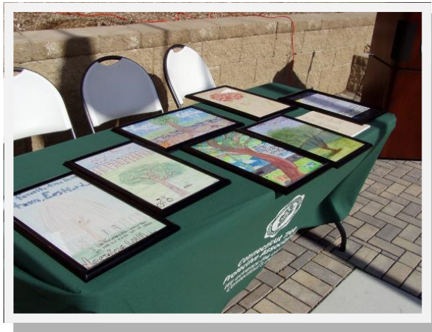
Winning posters for CTPA Arbor Day 2015 were on display at the ceremony.