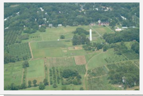
Lockwood Farm, Hamden