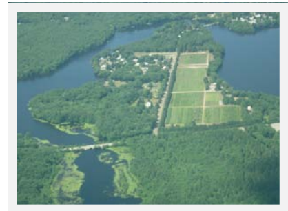
Griswold Research Center, Griswold