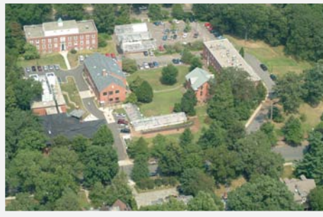
Main Laboratories, New Haven