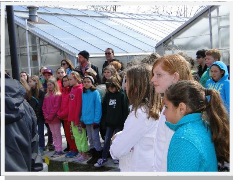
A standing-room only crowd consisting of contest winners, their 5 th grade classmates and teachers, and proud family members celebrated Arbor Day at CAES.

The Connecticut Agricultural Experiment Station