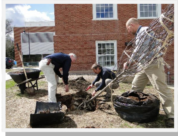
Planting the redbud tree for the CTPA-CAES Arbor Day 2015.