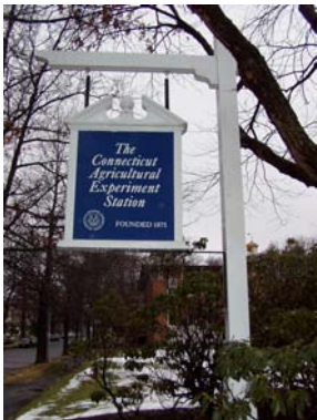
Entrance to The Connecticut Agricultural Experiment Station in New Haven on Huntington Street