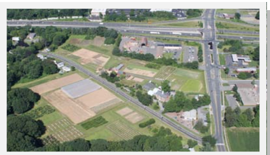
Valley Laboratory, Windsor