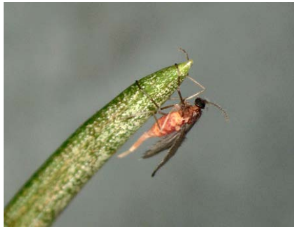
Figure 3. Adult female midge with protruding ovipositor.

LIFE CYCLE: According to Gagné there is one generation per year in New England. Partially grown larvae overwinter in galls and adults emerge in early spring and most likely do not feed. After mating, eggs are deposited on twigs or in bud scales. Larvae burrow into twig (shoot) and bud tissue, causing swelling and bending of twigs.