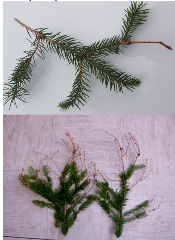
Figure 1: Damage to Norway Spruce.

of the midge larva (Figure 1). Loss of needles distal to twig galls is an indication of damage to the vascular system. This may be a result of larval feeding or gall induction. Lorraine Graney has isolated Phomopsis sp. from transitional tissue