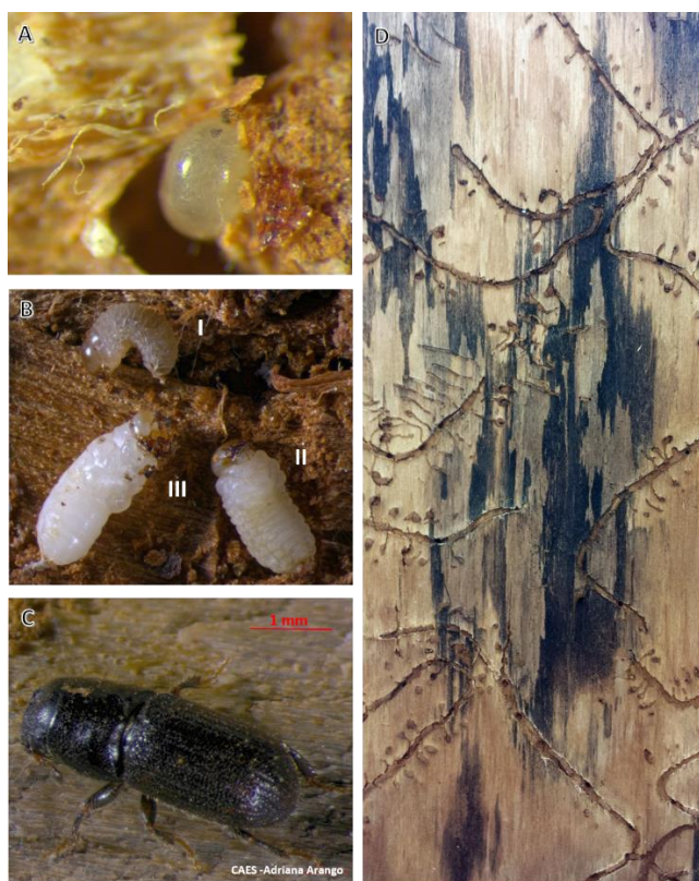
Figure 3. A: Eggs laid in niches along the galleries, B. I, II and III larval stages, which feed in the cambium until they are grown and then excavate areas near the bark surface to pupate. C. Adult beetle. D. SPB galleries, larval chambers and development of blue stain along the inner bark. E. Blue stain in the late wood of red pine ( Pinus resinosa ).

Once the beetles overcome the tree defense responses and bore under the bark, they proceed to feed and reproduce on the phloem, introducing the complex of microorganisms (fungi and bacteria) and mites. As they advance into host tissue, beetles disseminate these microorganisms along with a pathogenic 1 fungus (blue stain). At the same time, female beetles deposit numerous eggs along the sides of the galleries (tunnels in the inner bark). Larva feed outward into the phloem; completing their development inside the tree (Fig. 3A-D). To increase the probability of beetle population survival, female beetles exit the host and attack a nearby tree to lay additional eggs. SPB infestations are initiated in spring by dispersing beetles and can last through the remainder of the year until temperatures become too low (about 10°F). Beetles may have 3-6 generations per year, though 1-2 generations per year are most common in Connecticut. Parallel to beetle development, fungal growth occurs in the inner bark and sapwood ray cells causing desiccation, disrupting water transport, and eventually killing the tree (Fig. 3E-F).