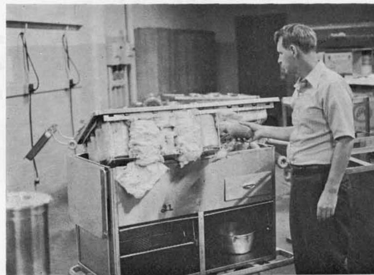
Figure 3.—Applying Drione dust to insulation of electrically heated food carts using a Centra-bulb duster.

Field tests with Baygon 2% roach bait were conducted in 30 newly constructed apartment units in New Haven. Half were treated with each bait formulation several weeks before tenants moved in. The bait was formulated as "crevice-sized" particles which could easily be applied with a Getz gun. Treated areas included those under and behind appliances, under radiators, in kitchen cabinet corners, on utility room and closet shelves, in sink cabinets, and in cracks, voids, and other enclosed areas. Wall voids were not treated. Particular attention was given to baiting false areas in and under kitchen cabinets because these provide excellent harborage for cockroaches. Between ½ and 1 lb. was applied per apartment. Monthly evaluations were made using the pyrethrin flushing technique.