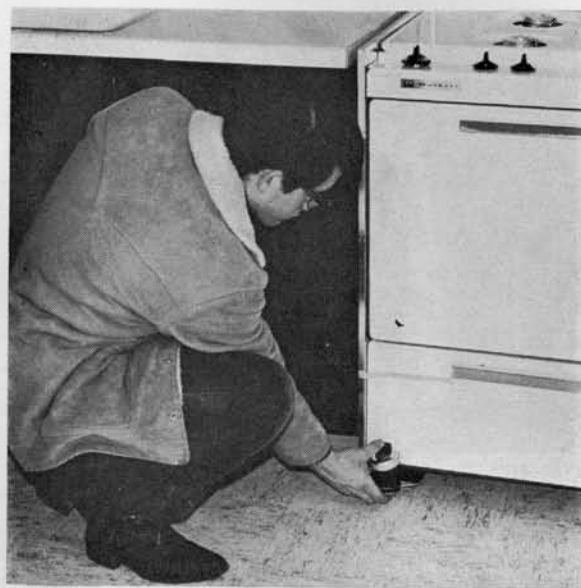
Figure 2.—Applying dust or bait using a Getz-gun hand duster.

The construction of the buildings studied was especially suited for this treatment. Dust could be blown throughout the wall-space through a single opening, such as an electrical outlet, because metal studs with a 4" opening every foot supported the wallboards. In walls without electrical outlets or other openings, a ¼" hole was drilled in the wallboard to inject the dust. Other areas treated with the pressurized duster included: 1. the basement area through which all common utility pipes ran; 2. the area where heating pipes entered wallspaces; 3. false areas under kitchen cabinets; and 4. enclosed soffit areas above cabinets. Several weeks before tenants began to move in, a hand duster (Getz gun) was used to treat other cabinet and closet areas and also under and behind kitchen appliances (Fig. 2). Approximately 5 lbs. of boric acid