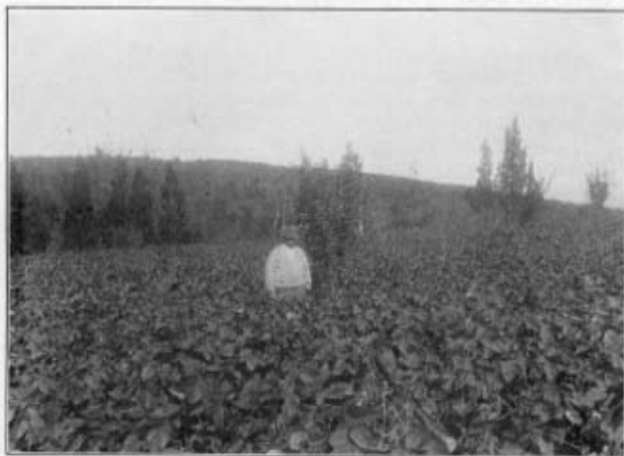
COVER CROP OF SOY BEANS, ABOUT FORTY INCHES HIGH.

The station will greatly enlarge its test of varieties in connection with selection work and hopes to have the most promising varieties growing at its farm next summer.