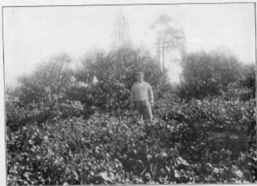
COWPEAS AS A COVER CROP.

The forage and seed therefore supply a very concentrated feed capable of reducing greatly the need of boughten concentrates. Both are relished by cattle and have proved to be satisfactory for feeding dairy stock, sheep and swine.