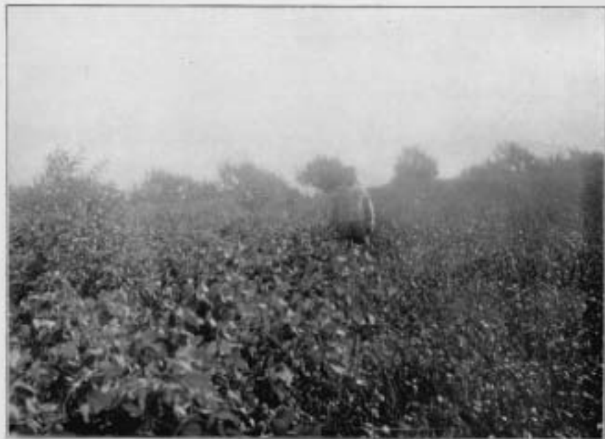
COVER CROP OF SOY BEANS ON LEFT, BUCKWHEAT ON RIGHT.

before. The orchard received 1 ton ground limestone, 133 lbs. nitrate of soda, 116 lbs. acid phosphate and 160 lbs. muriate of potash per acre. The beans were cultivated a few times before July 15, when cultivation ceased. During July and August there was very little rain and all crops suffered. On September 27 the soys were dark green, about 40 inches high,