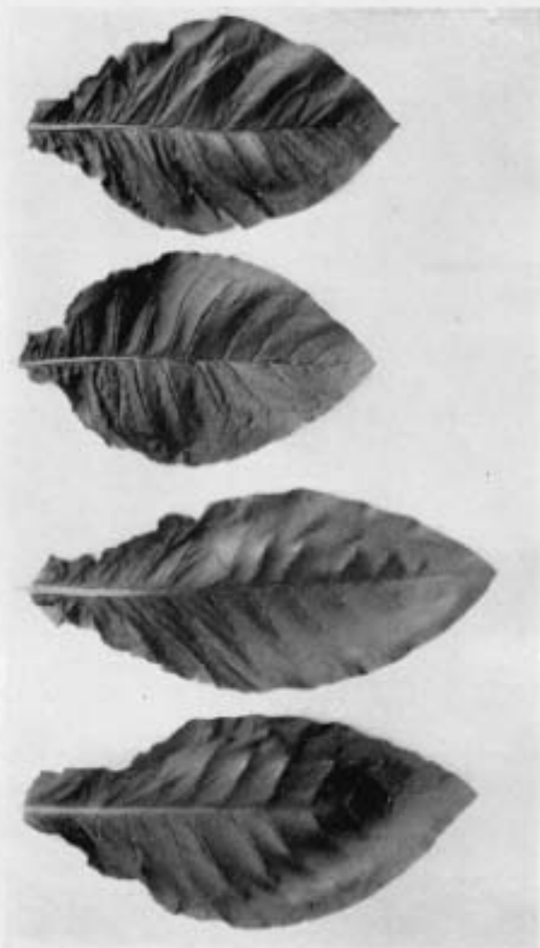
Middle leaves of the F_2 generation plants shown in plates X and XI. From left to right (402 x 405)-1-3, Havana segregator; 402-1-1, Havana; 405-1-1, Cuban; and (402 x 405)-1-2, which breed true for the Cuban leaf size and shape.