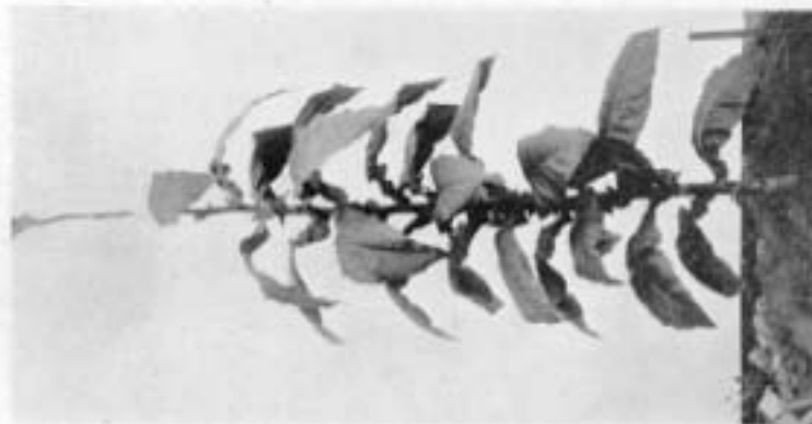
c. (403 x 402)-1, a tall vigorous plant of the F_2 of a cross between Sumatra and Havana bearing 30 leaves. New Haven, 1912.