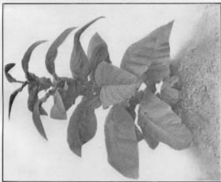
d. No. 403, Broadleaf. Averages about 19 leaves per plant. Leaves drooping in habit. Centerville, 1911.