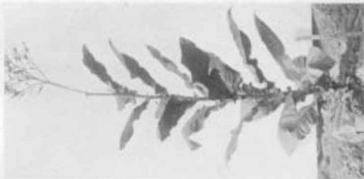
a. (403 x 402)-1, F_2 of cross between Sumatra and Havana. Plant of Havana type. New Haven, 1912.