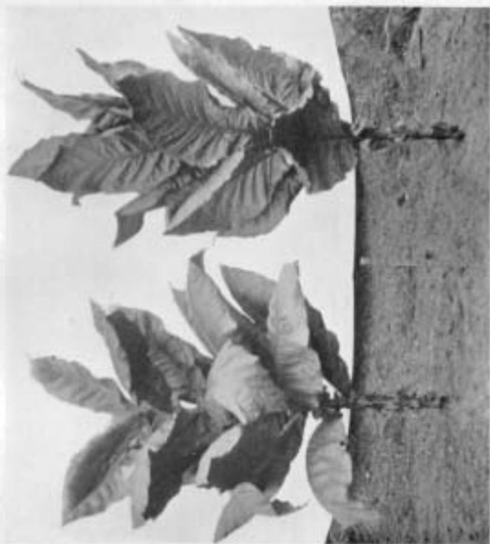
At right (12-2)-1 which has erect, wrinkly leaves, and at left (12-1)-1 which bears smooth, drooping leaves. These strains were produced from family No. 12 and are absolutely distinct. Bloomfield, 1912.