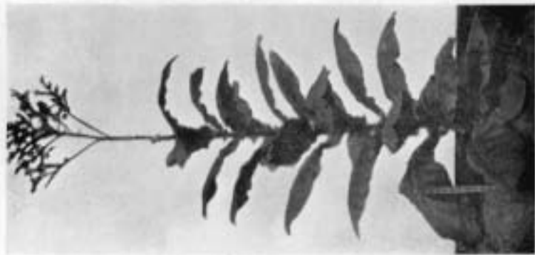
b. (403x402) 1 , an F_2 plant of the cross between Sumatra and Havana, bearing 26 leaves. Another "Halladay" type. New Haven, 1912.