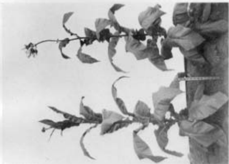
b. (403 x 403)-1-5, an F_2 generation of a cross between Samatra and Broadleaf which bred true for an intermediate leaf size and for the drooping leaf habit of the Broadleaf, and gave a mean leaf number of 22.0 \pm .08 and a C.V. of 7.54 \pm .27. New Haven, 1912.