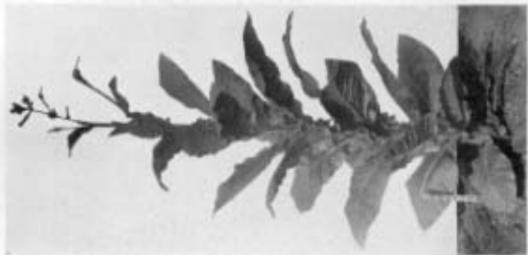
a. (403x402) 1 , an F_2 plant of the cross between Sumatra and Havana, bearing 27 leaves and short internodes. A "Havanna Havana" type. New Haven, 1912.