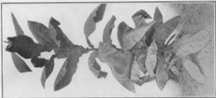
c. (402 x 405)-1-5, a F_3 generation of the F_2 of a cross between Havana and Cuban. Grown under cloth shade at Bloomfield, 1912. The progeny of this plant gave a mean leaf number of 28.0 \pm .28 leaves in 1912.