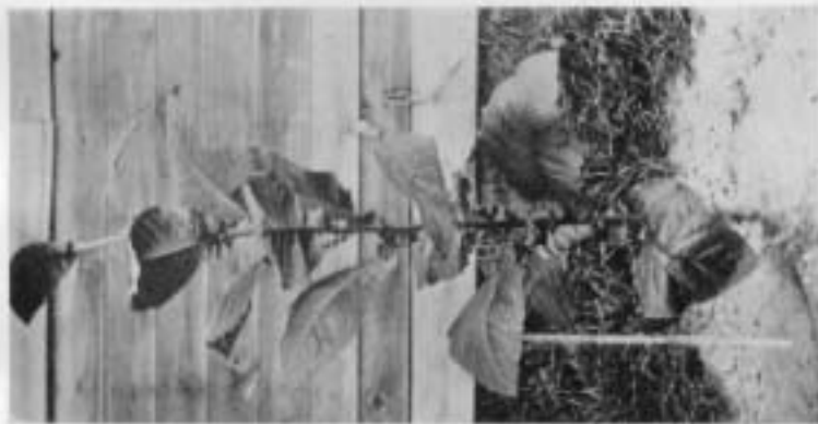
a. 405-1-1, Cuban. Averages about 20 leaves per plant. Grown under cloth shade, Bloomfield, 1912.