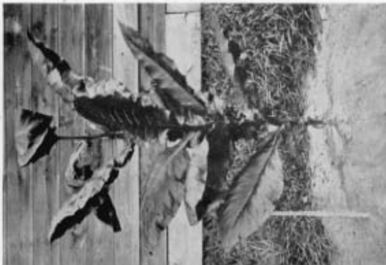
b. (402 x 405)-1-3. An F_2 generation of a cross between Havana and Cuban which gave a mean leaf number of 18.4 and which bred true for the Havana leaf characters. Grown under cloth shade. Bloomfield, 1912.