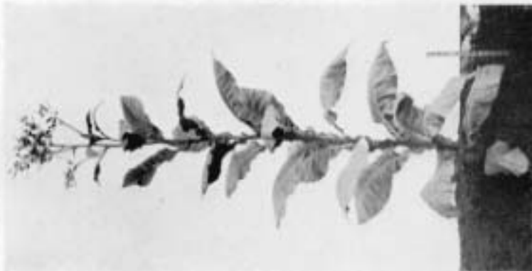
b. (403 x 402)-4, F_2 of cross between Sumatra and Havana. Plant resembling F_1 generation. New Haven, 1912.