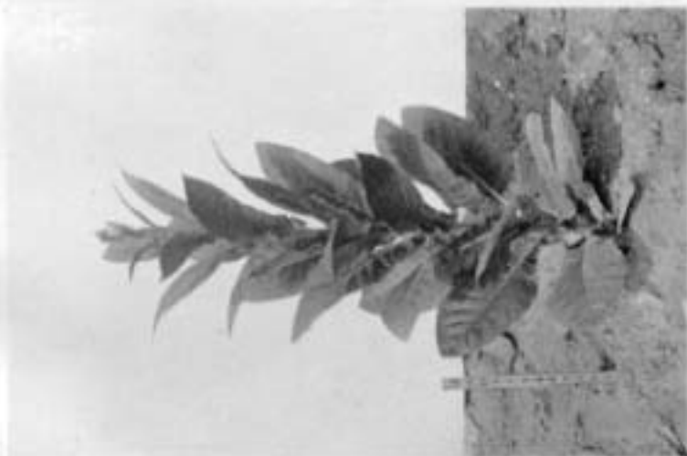
a. (403 x 402)-1, F_2 of cross between Sumatra and Havana. Plant bearing 28 leaves and short internodes. New Haven, 1912.