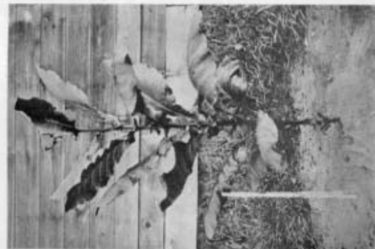
a. 402-1-1, Havana. Averages about 20 leaves per plant. Grown under cloth shade. Bloomfield, 1912.