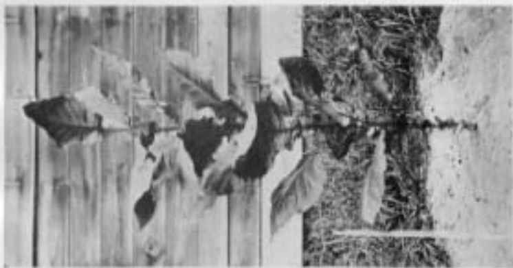
b. (402 x 405)-1-2, an F_2 generation of a cross between Havana and Cuban which bred true for the Cuban leaf size and shape but was very variable for leaf number. Grown under cloth shade, Bloomfield, 1912.