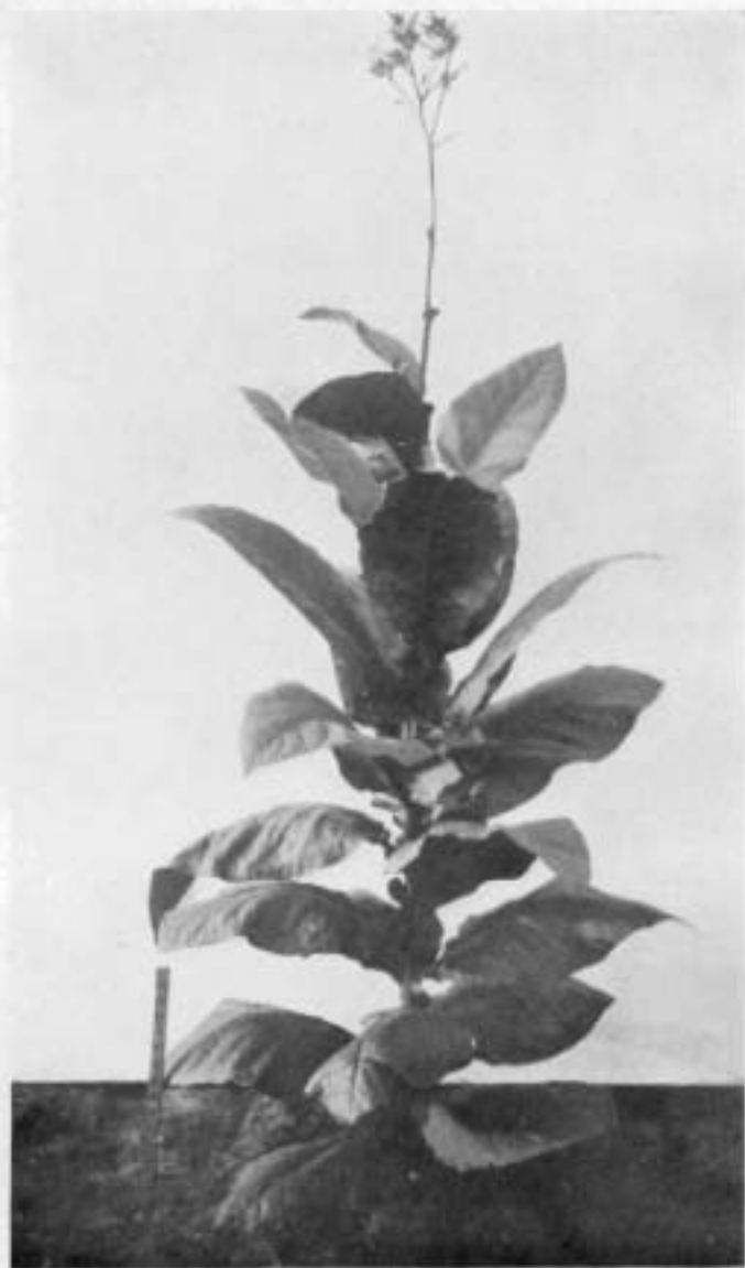
(403 x 401)-1-6, an F_2 generation of a cross between Sumatra and Broadleaf which gave a mean leaf number of 23.9 \pm .08 and a C.V. of 5.61 \pm .23 . The size of leaf is as yet very variable. New Haven, 1912.