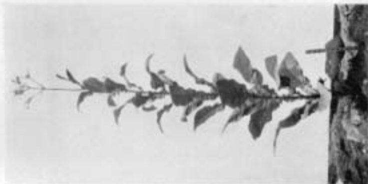
c. (403 x 402)-1, F 1 of cross between Sumatra and Havana. This plant could not be distinguished from pure Sumatra. New Haven, 1912.