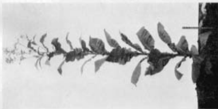
a. 403-1-1, Sumatra, averaged 26.2 leaves per plant. New Haven, 1912.