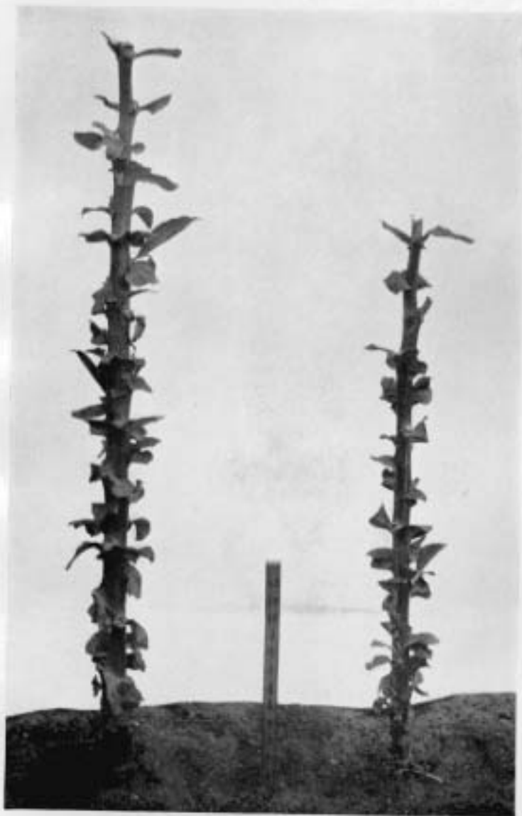
At left, 12-1-1, a vigorous strain and at right, K-1-1-2, non-vigorous strain of Halladay Havana, Bloomfield, 1912.