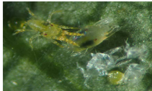
Figure 7: Male (left), female (right) two-spotted spider mite and cast skin