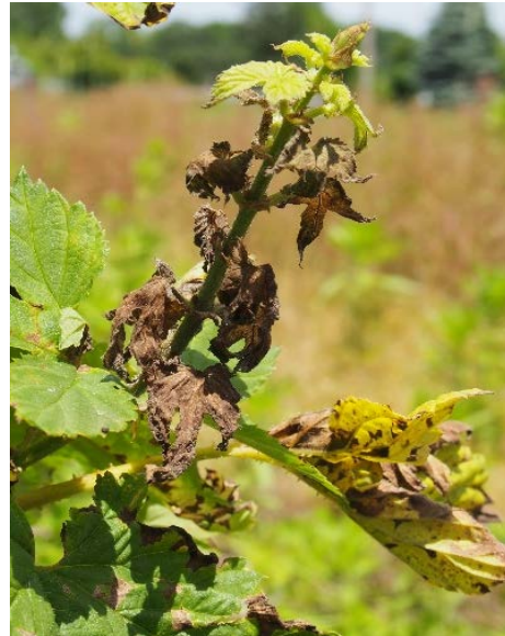
Figure 2: Spike - stunted shoot with short internodes