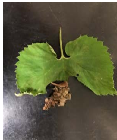
Figure 16: Bagworm “bag” formed on a hop leaf