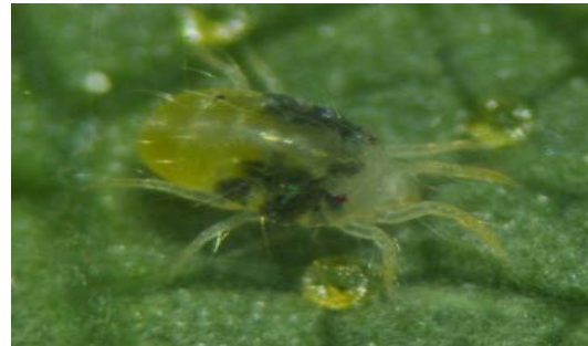
Figure 6: Female two-spotted spider mite

Weekly monitoring for mite presence and population density should be conducted during hot and dry conditions. Natural predatory mites and beneficial insects (e.g. big-eyed bugs, minute pirate bugs, lady beetles, spiders, and lacewings) can be encouraged or applied at first occurrence. The economic threshold is 1-2 adults/leaf in June and 5-10 mites/leaf by mid-July taking leaf samples from 10-30 plants. Above that level, spraying is often necessary. Warning: broad spectrum insecticides (e.g. pyrethroid, organophosphate, carbamate, and neonicotinoid insecticides) have a negative impact on beneficial insects and therefore, the application of these materials may increase the TSSM populations. Several miticides are available which do not harm beneficial insects. To avoid resistance, use miticides with different active ingredients. In addition to the insecticides listed in Table 3, the fungicide, Prev-AM Ultra also has efficacy against TSSM (Table 1). Stripping of lower leaves of the hop plants, minimizing dusts, and providing habitat for natural enemies helps to keep the population under control. Be careful spraying oils during hot, dry conditions or when hops are flowering as the oils can damage the plants.