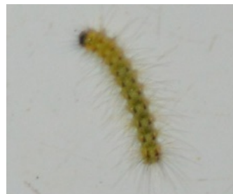
Figure 12: Black-headed Fall webworm larvae