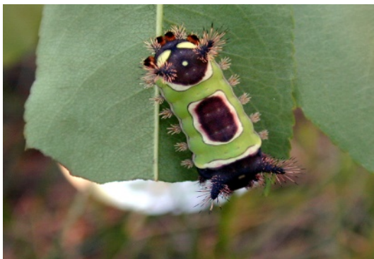
Figure 14: Saddleback caterpillar