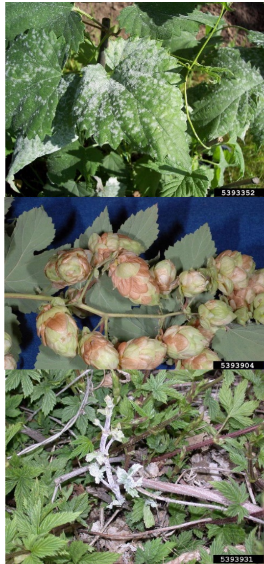
Figure 4: A) Hop leaves with severe powdery mildew caused by Podosphaera macularis . B) Cones with reddish-brown discoloration. C) Hop shoot (flag shoot) colonized by Podosphaera macularis resulting from crown bud infection and perennation.