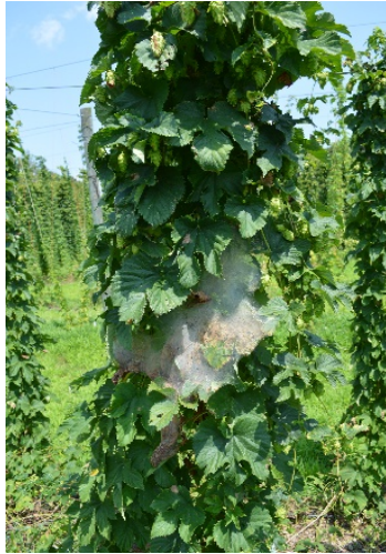
Figure 13: Webs surrounding hop leaves of Fall Webworm