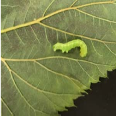
Figure 17: Cabbage looper feeding on hop leaf