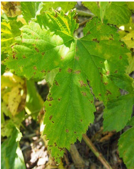
Figure 1: Angular leaf lesions