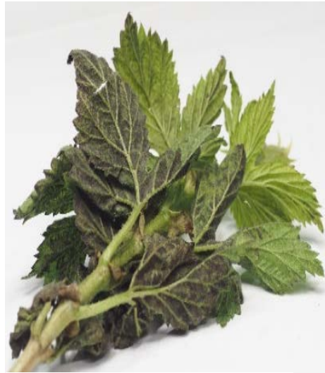
Figure 3: Sporulation of the downy mildew pathogen on the underside of leaves