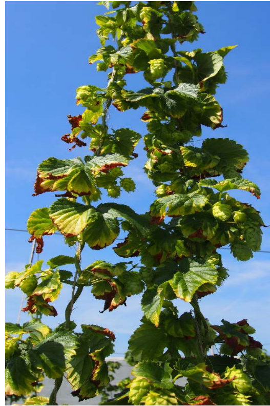
Figure 10: Symptoms on leaves