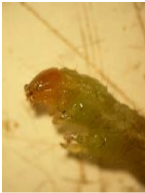
Figure 18: Head of cabbage looper