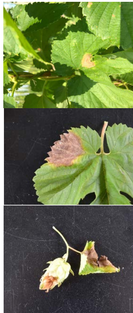
Figure 5: A and B) Hop leaves with lesions characteristic of Phoma wilt B) Cone yellow in appearance with areas of reddish-brown discoloration.