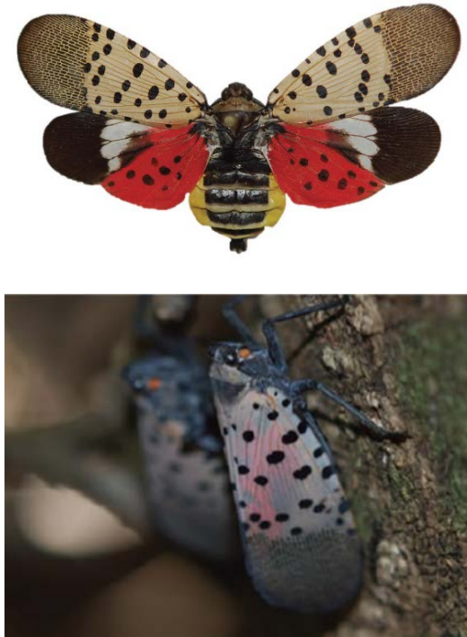
Figure 20. Adult Spotted Lanternfly. Photo courtesy of Park et al., 2009. Biological characteristics of Lycorma delicatulata and the control effects of some insecticides.

If you suspect you have Spotted Lanternfly in your hop yard, please bring specimens or send photographs to the Connecticut Agricultural Experiment Station for further evaluation. Information on submission, and more information on this pest, can be found at https://portal.ct.gov/CAES/Publications/Publications/Pest-Alerts