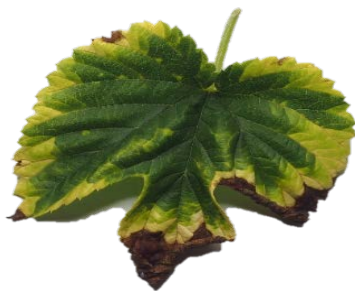
Figure 9: Hopper burn