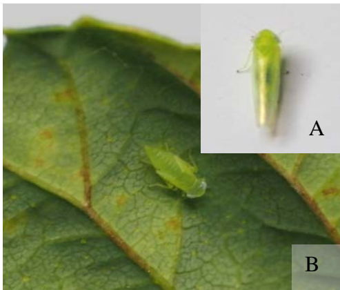
Figure 8: (A) Adult and (B) nymph

Potato leafhoppers infest more than 200 species of broadleaf plants. They occur in the Northeast between late spring and mid-June. Leafhoppers overwinter in the south and wander north during the storm season in spring. Adults are bright green with wings and only 1/8-inch (3 mm) long (Figure 8A). They are able to move quickly forward, backward, and sideways, leaping and flying. The nymphs are smaller than adults, wingless and pale green (Figure 8B). Potato leafhoppers start appearing in hop yards in May and their occurrence grows slowly until June and July. Most of the damage occurs from mid-June to mid-August. The entire life cycle lasts 1 month and 2-3 generations occur each year. The insects suck the plant juices out of the veins in the leaves using their mouth-parts. A saliva toxin blocks the veins to get nutrients. The first sign is yellowing at the leaf tip followed by necrosis and curling (Figures 9 and 10).