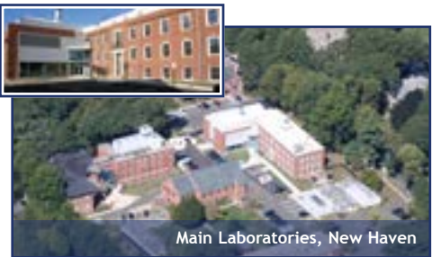
Main Laboratories, New Haven