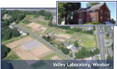
Valley Laboratory, Windsor