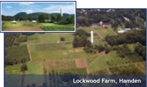
Lockwood Farm, Hamden