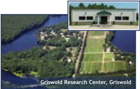
Griswold Research Center, Griswold

The Connecticut Agricultural Experiment Station is a state-supported scientific research institution dedicated to improving the food, health, environment, and well-being of Connecticut's residents since 1875.