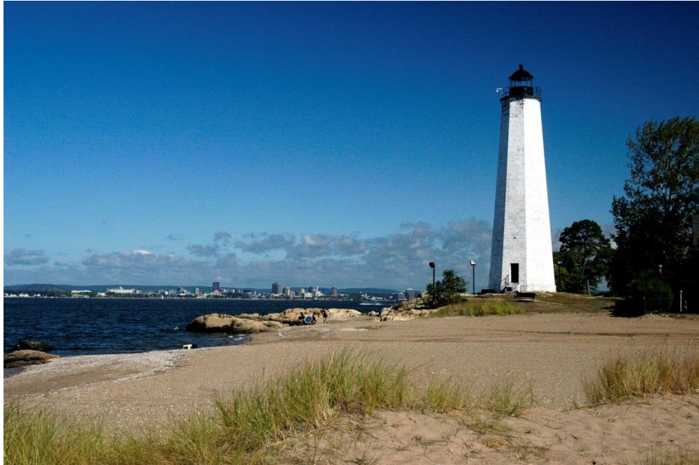
Lighthouse Point Park, New Haven